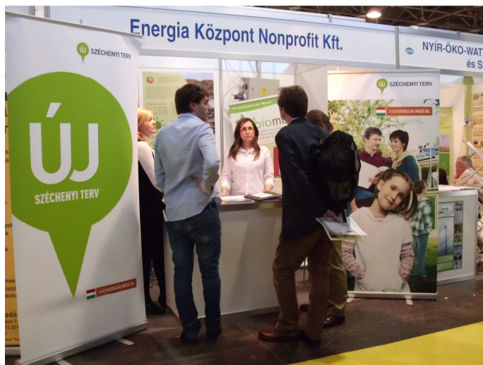
Image1: Stand of Energy Centre

Energy Centre was present at the event with presentations and a stand.